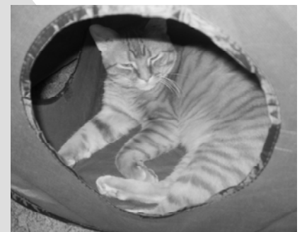
Orville was adopted from PetSmart in Sheboygan.